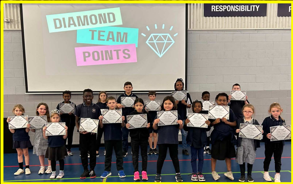
Winners of Diamond Team Points Week 11 Term 1 2024